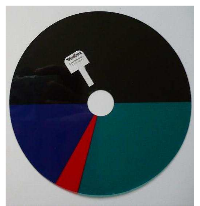
Fig.1 Madtronix Colour Wheel for 3D Mine Storm