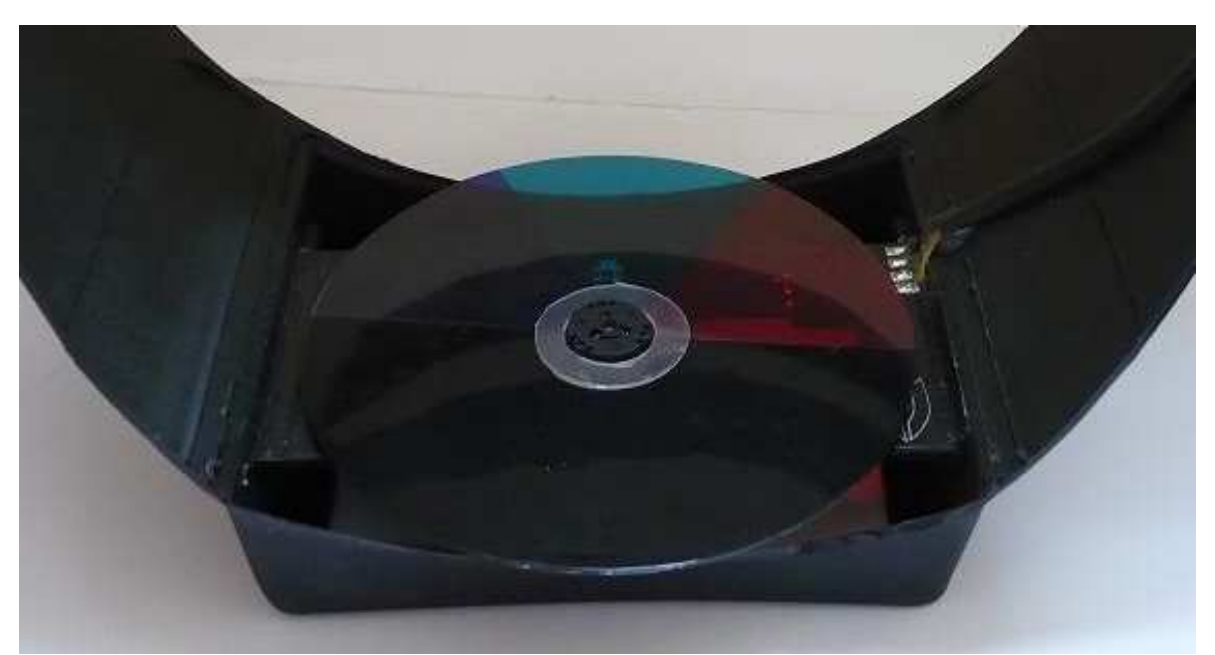
Fig. 3 View inside the 3d Imager, showing the colour wheel and placement of so called "calibration" wheel/ring.